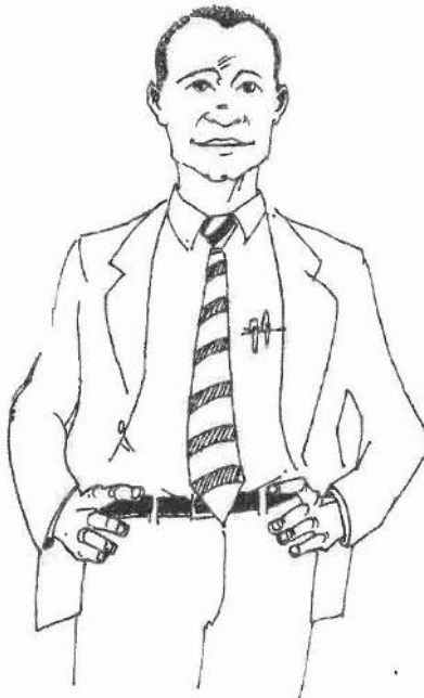
Figure 98 Ready for action

In each instance, the individual is seen standing with the hands-on-hips pose, for this is one of the most common gestures used by man to communicate an aggressive attitude.