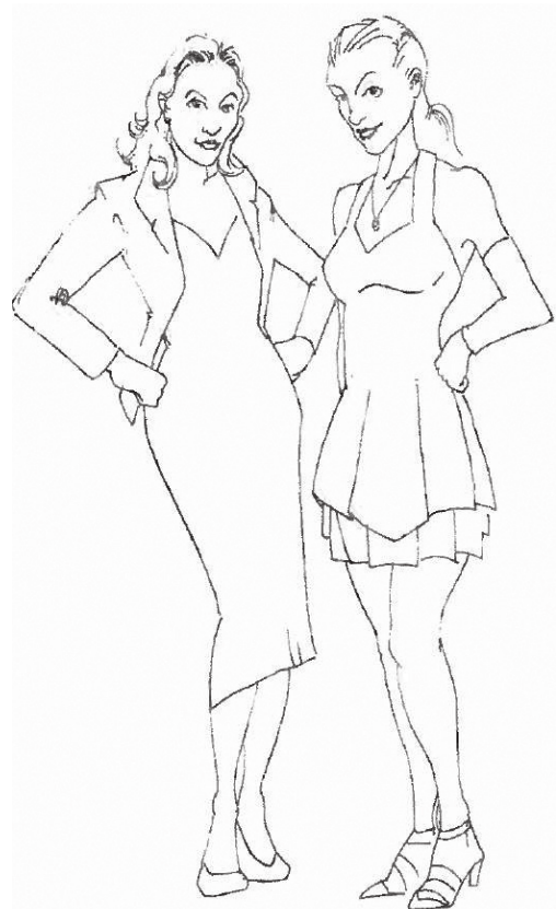
Figure 99 Hands-on-hips gesture used to make clothing seem more appealing

The aggressive-readiness clusters are used by professional models to give the impression that their clothing is for the modern, aggressive, forward-thinking woman. Occasionally the gesture may be done with only one hand on the hip and the other displaying another gesture (Figure 99). Critical evaluation gestures are often seen with the hands-on-hips pose.